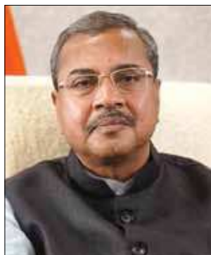
Dr. Munjpara Mahendrabhai

Minister of State, Women and Child Development